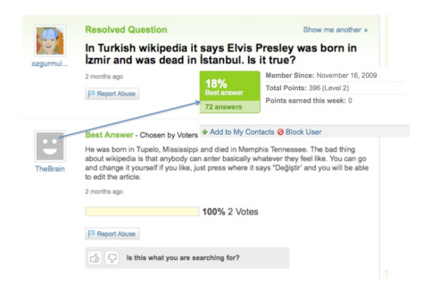
Figure 3. Yahoo! Answers

Web, this has been updated in services such as Yahoo! Answers (answers.yahoo.com) to allow users to pose questions to a community of online respondents, who provide answers asynchronously. The users can then use statistics compiled on the various respondents in order to assist in evaluating both the source and the content of the answer provided (the number of answers they have provided, their areas of expertise, the amount of positive feedback they have received, etc. Figure 3). A simpler question-broadcast service is incorporated as the "Shout Box" function in the Army's Intelligence Center Online Network (ICON) [3].