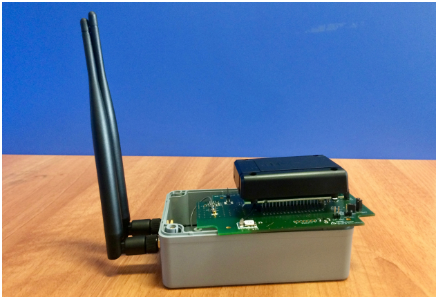
Figure 1: A MagoNode++ mote.

The MagoNode++ is a platform for IoT wirelessly networked systems designed for low-energy consumption applications [2]. The mote is equipped with a wake-up module designed to use On-Off Keying (OOK) modulation at the operating frequency of 868MHz. The module comprises a wake-up transmitter (whose data rate is set to 1kbps) and an ultra-low power wake-up receiver, consuming 560nA of current at 3V. The receiver is characterized by high sensitivity (up to -55dBm) and selective addressing capability [6]. A picture of a MagoNode++ is shown in Figure 1.