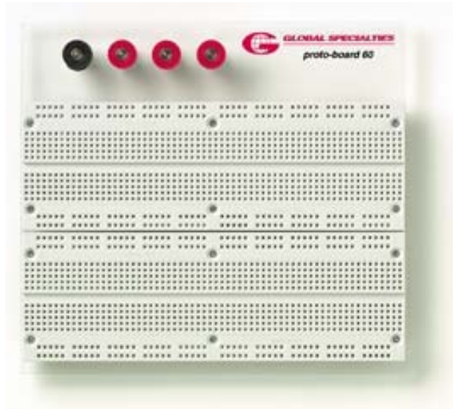
Front-side view of a proto-board showing the tie points arranged in rows and columns

Proto-Boards: Throughout this lab you will use a proto-board. Proto-boards are useful for quickly assembling circuits without soldering. The front side of the board consists of long rows of tie points that are all connected together. These rows are useful for distributing supply voltages throughout the board. Surrounded by these long rows, are columns of five tie points. Each group of five is connected under the surface as shown in the back-side view below. Integrated circuits should straddle the deep groove running along the board such that each pin of the IC is connected to a unique 5-hole tie point.